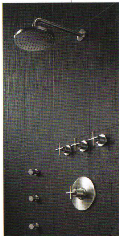
California Faucets' StyleTherm system allows for a truly customizable shower experience.