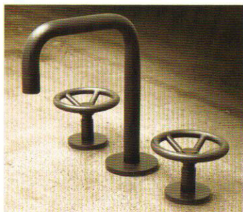
The Brooklyn Collection by Watermark Designs offers an industrial feel.