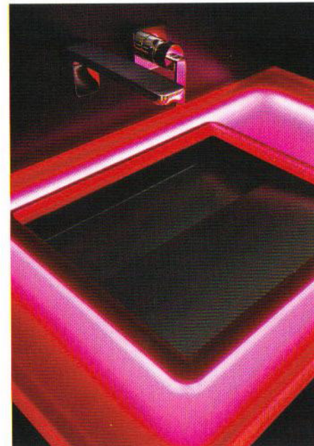
Neo Metro's Ebb Concept utilizes LED technology.