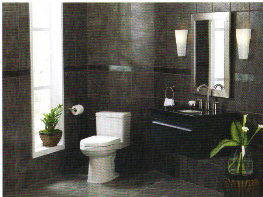
Gerber offers a sophisticated take on bath fixtures with its Wicker Park Suite.

Moving away from the world of fixtures, MirrorMate also is displaying some hot new looks for hoteliers looking for an update in bathroom décor. President Lisa Huntting noted a framed mirror "is a standard in the design world today. MirrorMate provides an innovative, cost-effective way to add a retrofit frame to any mirror currently on the wall and achieve an up-to-date, finished look in the bathroom in a matter of minutes. The pre-taped frame attaches directly to the mirror while [it's] still on the wall, so there is no room downtime. It's an affordable way to salvage an older mirror by covering desilvering, and provides a current, designer look."