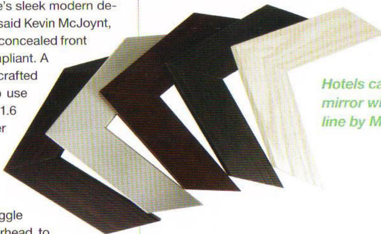
Hotels can give new life to an old mirror with The Cherokee Slim line by MirrorMate.