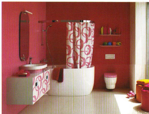
Laufen takes a minimalist approach with the new Mimo Collection.