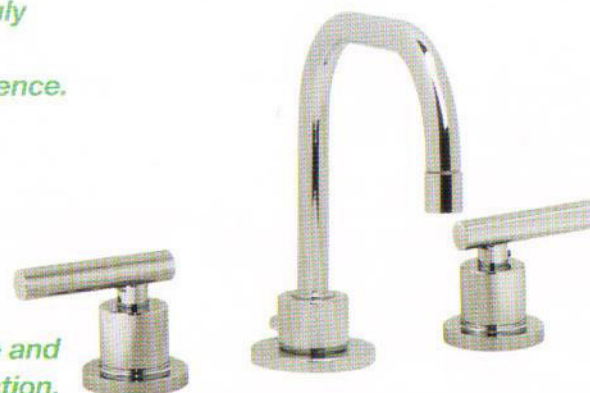
Symmons blends style and simplicity with its Dia Collection.